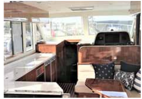
Fuel Capacity 1100 Litres Water Capacity 550 Litres Holding tank 76 Litres Construction Hand laid fibreglass