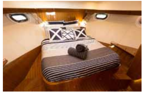
Length Overall 11.70 m Beam 4.11 m Draft 1.30 m Displacement 9.500 kg