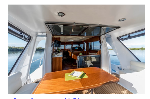
Length 11.70 m Beam 4.10 m Draft 1.16 m Displacement 11.000 kg