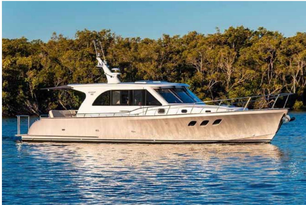
NP46014.00x4.20x1.05M Cummins QSB 6.7 480HP