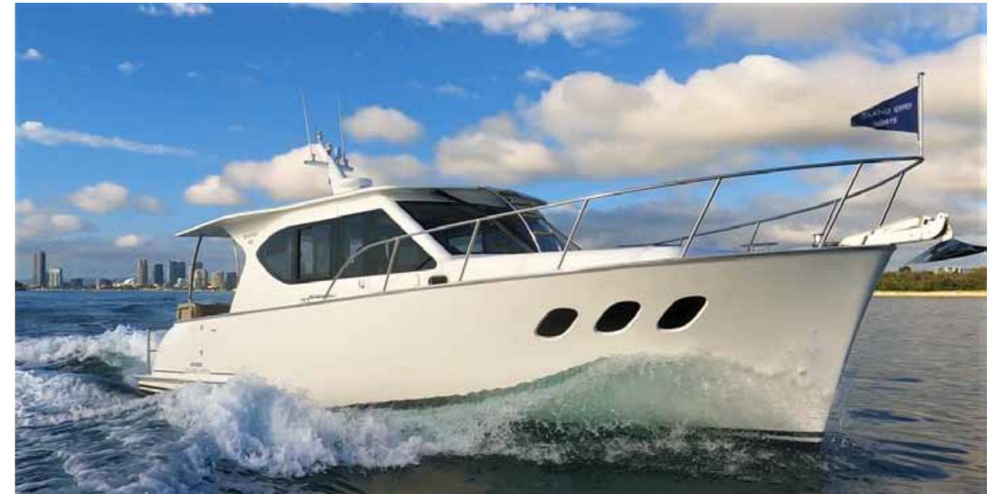
IG 400 12.20x3.96x1.20M Cummins QSB6.7 380HP