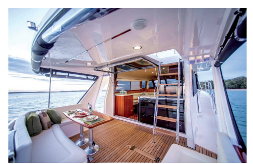
Length 11.70 m Beam 4.10 m Draft 1.16 m Displacement 11.500 kg