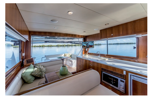
Fuel Capacity 1135 Litres Water Capacity 530 Litres Holding tank 175 Litres Construction Hand laid fibreglass